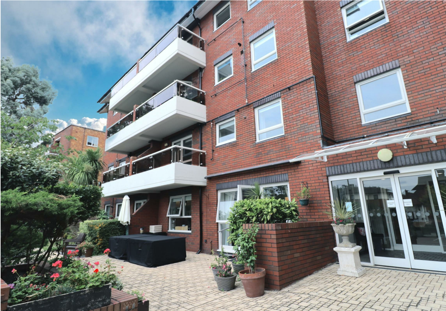
Finchley Road, London, NW11 7SB

Nestled in the desirable area of Golders Green, NW11, this one-bedroom retirement flat offers a perfect blend of comfort and convenience. Located just a short walk to Golders Hill Park and Hampstead Heath. Upon entering, you will find a welcoming reception room that provides a relaxing space to unwind or entertain guests. The flat features a well-appointed bedroom, ensuring a peaceful retreat at the end of the day. The shower room is thoughtfully designed and includes heated towel rail. One of the standout features of this property is the inviting communal lounge, where residents can socialise and enjoy a sense of community. The beautifully landscaped front and rear gardens offer a serene outdoor space, perfect for enjoy some morning sunshine and there is also plenty of parking. Accessibility is a key consideration in this flat, with lift access available, making it suitable for all residents. This property not only provides a comfortable living environment but also fosters a sense of belonging within a supportive community. In summary, this one-bedroom purpose-built flat on Finchley Road is an excellent opportunity for those looking for a peaceful and accommodating living space in a vibrant area. With its thoughtful design and communal amenities, it promises a delightful living experience.